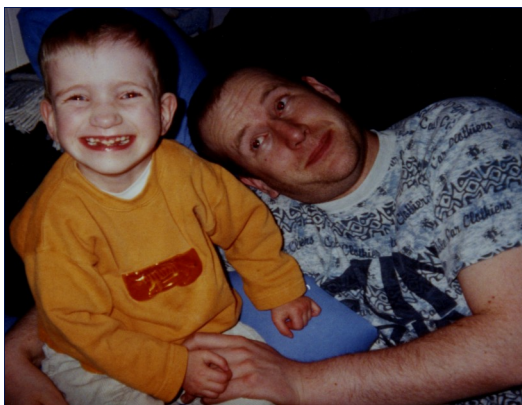
4 years old

especially for visual mapping and images. Their relative visual strength is good for computer work and games. In terms of personality, as a group they are determined and try hard. Most boys are sociable and they like to perform as well as their classmates and to please their teacher. Among boys of secondary school age and older, some are able to read and write a little but they may need prompting and support. They may acquire enough skill at a computer to play games and use word and image based programmes. In general, the level of learning difficulty can vary from mild to severe. Early studies assumed boys to be 'universally cognitively impaired' meaning that their overall brain function was thought to be reduced with reports describing IQ's ranging from below average to severely intellectually disabled. However, these assessments relied heavily on verbal output and boys with XXXXY syndrome struggle with verbal skills and language formation. More recent studies have identified non-verbal IQ and visual perception to be within the average range in some boys with XXXXY highlighting previously unappreciated areas of strength in cognitive skills (Gropman 2010; Gropman 2013). Boys with XXXXY syndrome may also be diagnosed with other disorders that can affect their ability to learn. Two XXXXY Unique members have been diagnosed with autistic spectrum disorder, two with ADHD and one with dyspraxia.